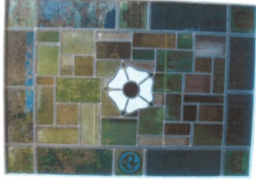
Newly restored stained glass window

Methodist – Thorganby Village, telephone contact 01904 702223