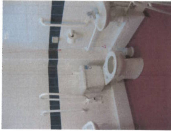
Disabled Guests' Wet Room

White Rose House can accommodate a maximum of 100 people for daytime meetings and can sleep up to 30 people (including adults), on camp beds.